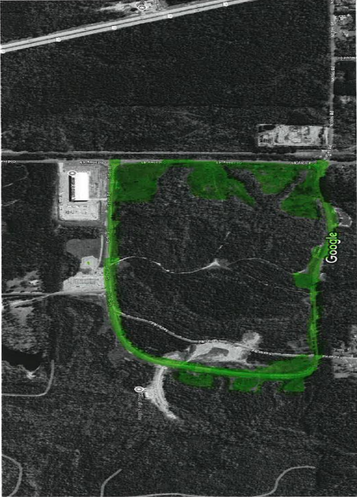
Imagery ©2024 Airbus, Maxar Technologies, Map data ©2024 200 ft